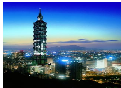
Taipei 101 Shopping Mall