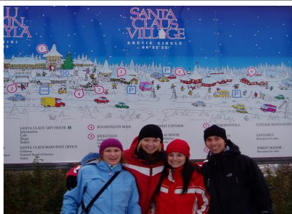
Santa Claus Village

We are going to visit the Reindeer farm with reindeer driving & show. Herding reindeer is an integral part of the Lapp heritage, and even today reindeer husbandry provides some 2000 Lapp families with a livelihood. The host of a local reindeer farm will tell you more about this old tradition and the Lapp lifestyle, while you visit his farm. Try throwing a reindeer lasso and enjoy coffee with cake in a Lapp tepee.