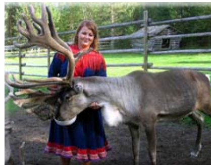
Reindeer Farm Saariselka