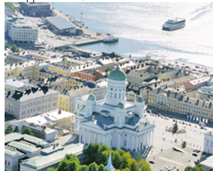
Helsinki City Ivalo

The city tour takes in the most interesting parts of Helsinki, such as the historical center with Senate Square, Presidential Palace, City Hall, the Parliament building, and you will also stop at the Sibelius Monument and, the Tempelliakio Church.