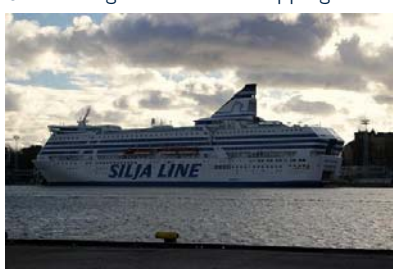
Cruise from Helsinki to Stockholm

Rovaniemi on the Arctic Circle is home to Santa Claus. Where you will experience a special Lapp ceremony of crossing of the Arctic Circle and certificate will be given. Here the spirit of Christmas is kept alive every day of the year! Enjoy some free time at Santa Claus Village & do some shopping.