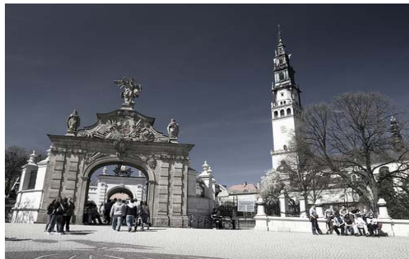
Jasna Gora Monastary

One of the best preserved medieval city in Europe. Guide tour begin from The Old Town, a significant UNESCO World Heritage ,with magnificent churches and palaces lining the old streets. Stroll through the grandest Old Market Square. Entrance to Wawel Castle is included.