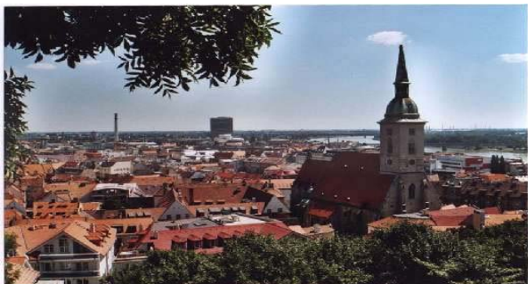
Old Town of Bratislava.

Guided tour of this mesmerizing Hungarian capital starts with a drive along classy Andrassy Avenue to monumental Hero Square. Pass by the spectacular Parliament on the way to the hill top castle complex of Fishermen's Bastion( entrance included) to view the Matthias Church , Royal Palace and sweeping city views below. Stop by at St Gellert Hill for more panaromic delights and in the evening enjoy a Ghoulash dinner with Gypsy entertainment.