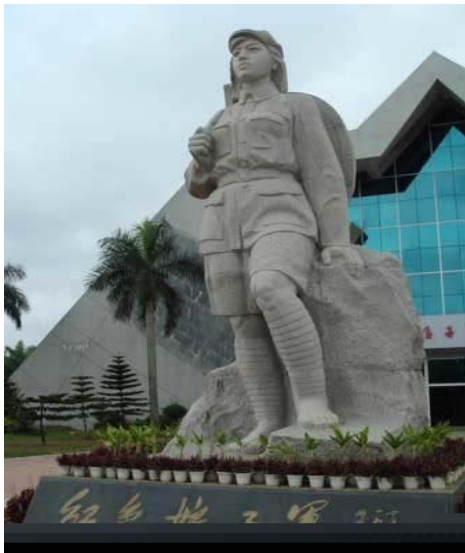
Red Women Army Statue